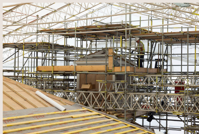
Riding School clock tower undergoing restoration, August 2025

Our heritage contractors, Walter Lily, have been making considerable progress on the restoration of the Riding School building fabric, including conservation of the old clock tower. Once complete, this original feature will be reinstated with four newly crafted clock faces.